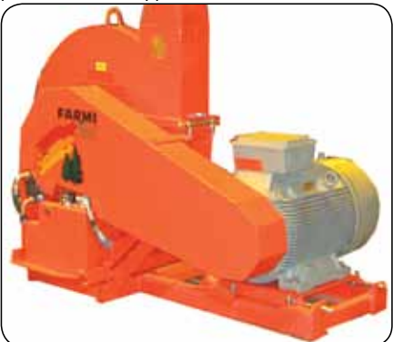
FARMI 260, equipped with an electric motor on the SML232 mounting base

The following optional equipment is offered for the FARMI 260 HFEL and HFC models: an own hydraulic unit (HD11), electric pedal control of the feed unit and hydraulic functions for swiveling the discharge pipe, adjusting the discharge pipe lid and opening the upper chamber. When using the separate support unit, the chipper/crane combination FARMI