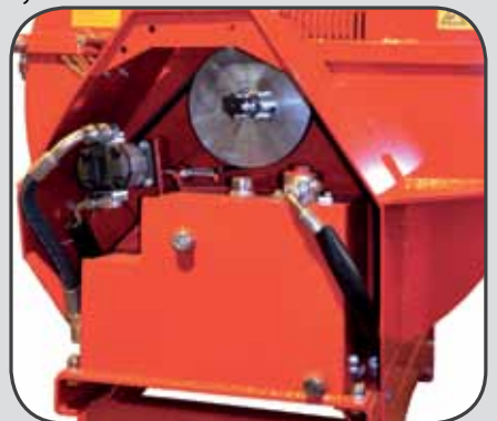
Hydraulic unit HD11

On the FARMI chipper 260 F, the feed system is designed to ensure a wide feeding angle for inclined infeed and thus to produce a self-pulling effect. For the FARMI 260 HF series, two hydraulic feed rollers are used for feeding. The CH260 HF-HM model is equipped with hydraulic control and the CH260 HF-EM model