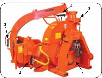
FARMI 380 in transport position

As standard, the FARMI chippers 380 HF and HFC are equipped with an own hydraulic system (1) which drives both the feed unit and the standard roller swing of the upper feed roller (2) and controls the discharge pipe (3) . However, the tractor hydraulic system is used to retract the pipe into its transport position (4) and to open the upper chamber.