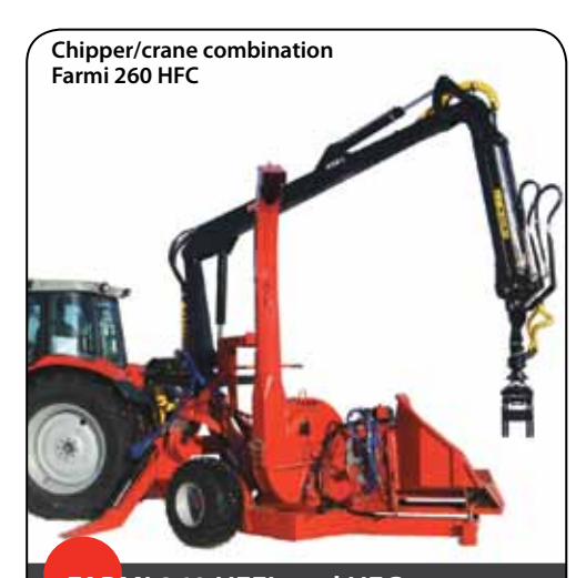
FARMI 260 HFEL and HFC

For the chippers of the 260 series, a mounting base for the direct drive via electric motor (SML232) is available. If this mounting base is used, the chipper can be mounted on the same mounting platform as the electric motor.