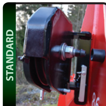
A strong lower pulley can be quick-locked for transportation