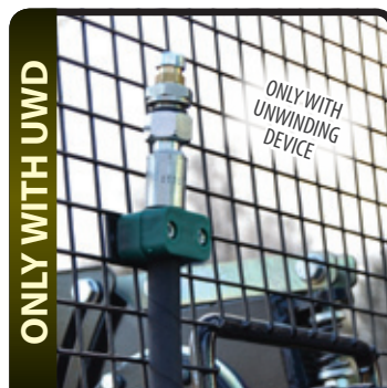
The Breather of Hydraulic System is attached high to the safety screen to avoid oil to leak to the winch mechanism.