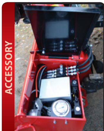
The hydraulic system for unwinding device is located safe in the covered tool box. Easy to service.

FARMI, a pioneer in winch construction, has now enlarged its series of three-point mounted winches for demanding circumstances by a new model called FARMI JL86. The development of this new professional winch model is based on over 50 years of experience in winch construction. FARMI JL86 solid construction guarantees a long working life and comfortable operation. High drum storage capacity, uniform winding, light-weight, compact design, reliable function and close attachment are the main features of FARMI skidding winches. The FARMI JL86 winch is a safe and high-performance tool that can be used practically in most forest applications. Available are three different versions: a rope controlled model, a hydraulic controlled model and also a model equipped with unwinding device and remote control for fully professional operations.