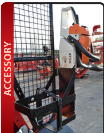
Handy holder for chainsaw and jerry can