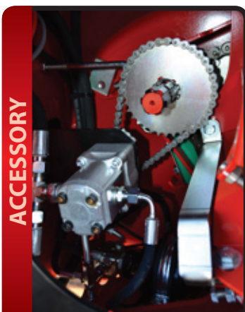
Hydraulic unit driven by PTO with unwinding device

FARMI, a pioneer in winch construction, has now enlarged its series of three-point mounted winches for demanding circumstances by a new model called FARMI JL86. The development of this new professional winch model is based on over 50 years of experience in winch construction. FARMI JL86 solid construction guarantees a long working life and comfortable operation. High drum storage capacity, uniform winding, light-weight, compact design, reliable function and close attachment are the main features of FARMI skidding winches. The FARMI JL86 winch is a safe and high-performance tool that can be used practically in most forest applications. Available are three different versions: a rope controlled model, a hydraulic controlled model and also a model equipped with unwinding device and remote control for fully professional operations.