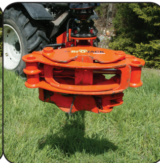
Blade inside the frame